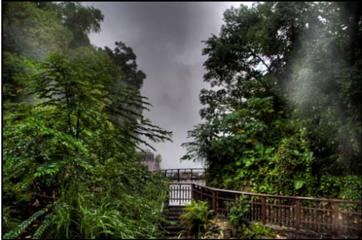
Beitou Hot Springs Park where water is ejected above 90°C.