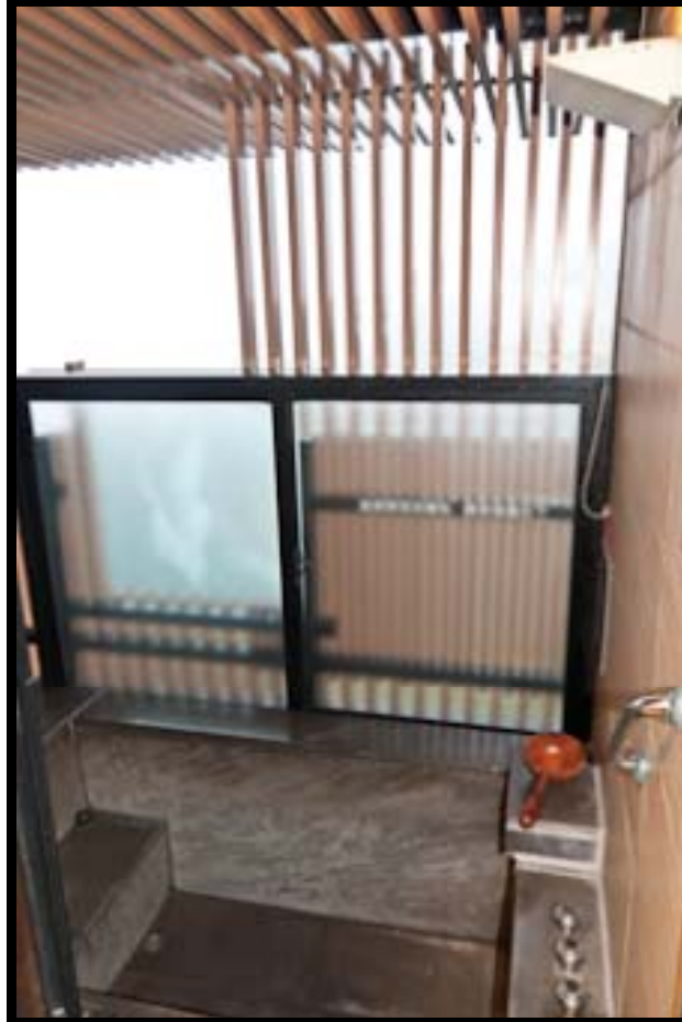
Hot spring soaking soaking tub ensuite at Tien Lai Hot Spring Resort, Taipei County, Taiwan