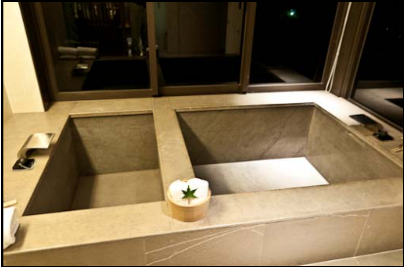
Hot springs tubs at Grand View Resort Beitou in Taipei City, Taiwan,