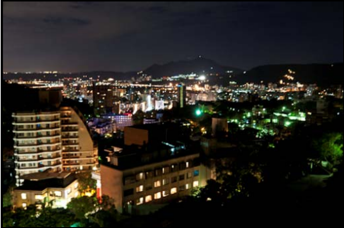
Nighttime view of Taipei from either the porch or the hot spring tub at the Grand View Resort