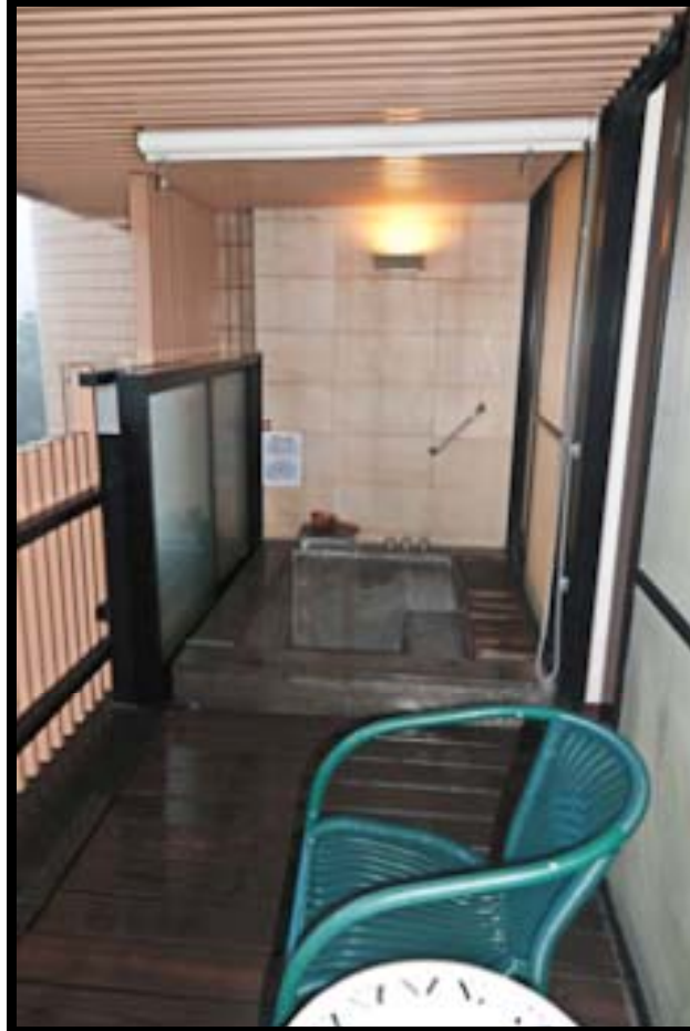
Hot spring tub on porch of Tien Lai Hot Spring Resort, Taipei County, Taiwan