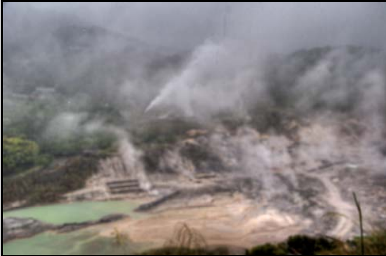
Beitou Thermal Valley with its green sulphur springs - one of only two such volcanic sources in the world.