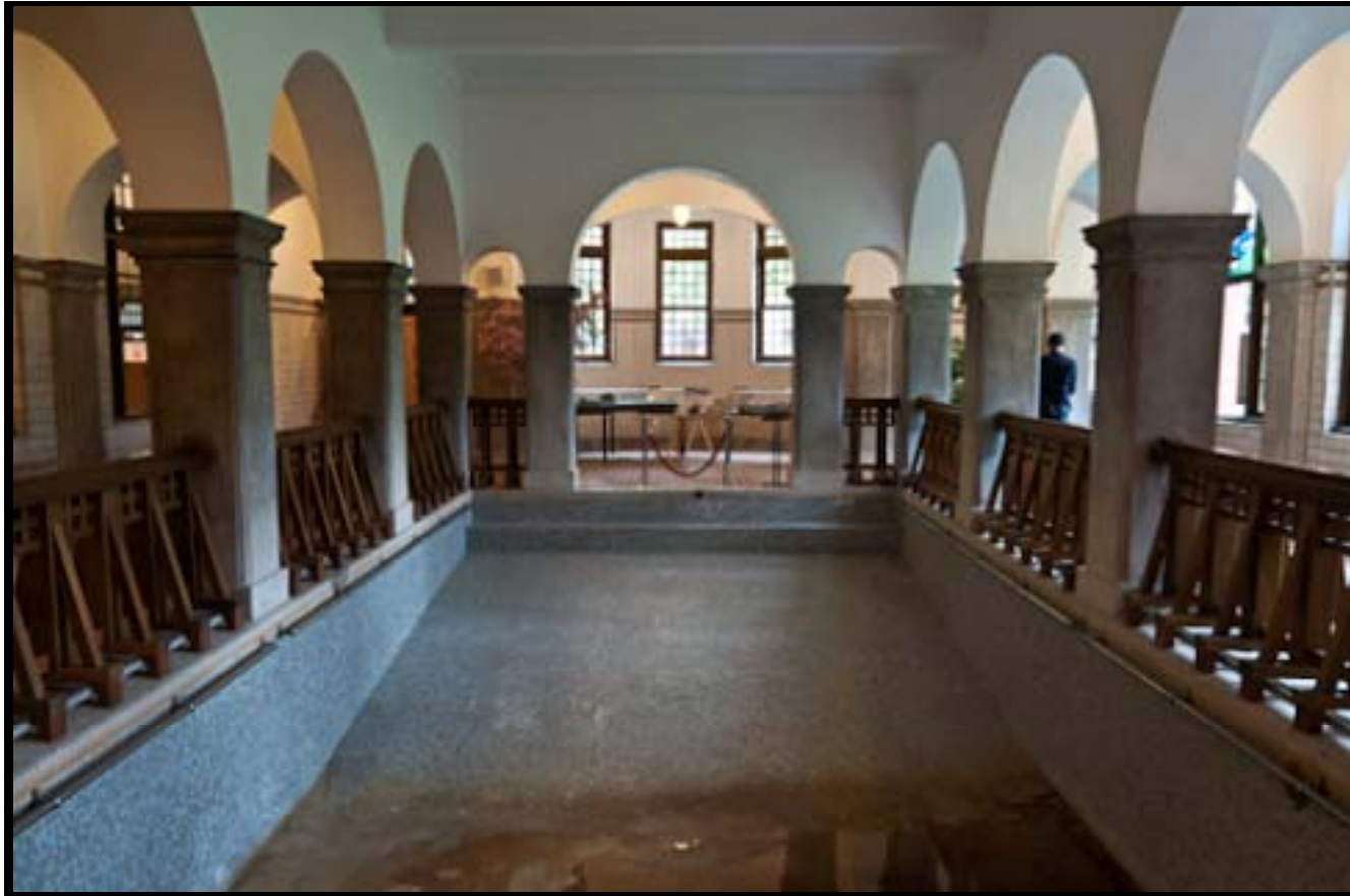
Beitou Public Hot Spring Bath - no longer in use as a public bath, but now converted into a museum about the history of the area's unique green sulphur volcanic geysers.