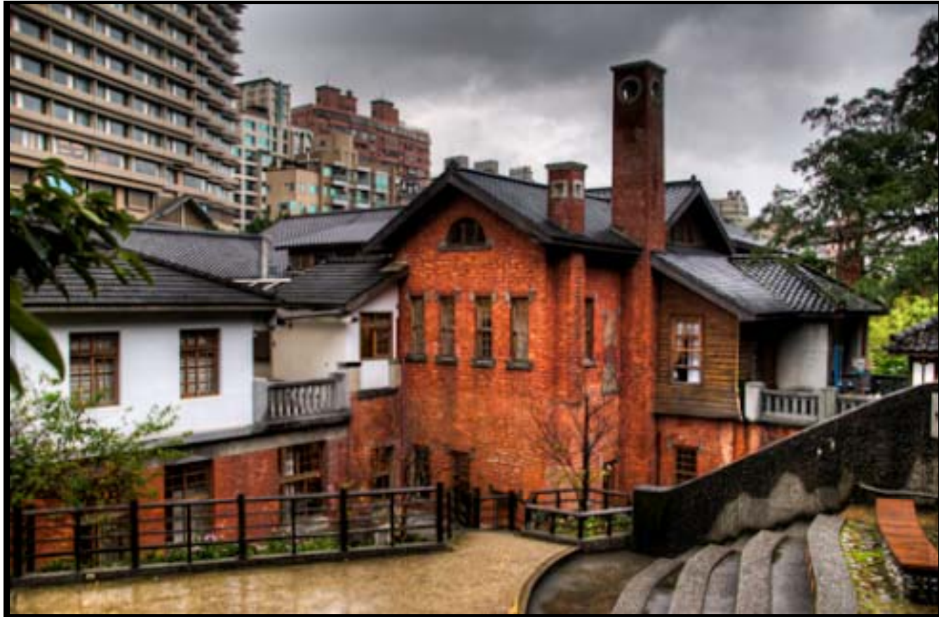
Beitou Public Hot Spring Bath - no longer in use as a public bath, but now converted into a museum about the history of the area's unique green sulphur volcanic geysers.