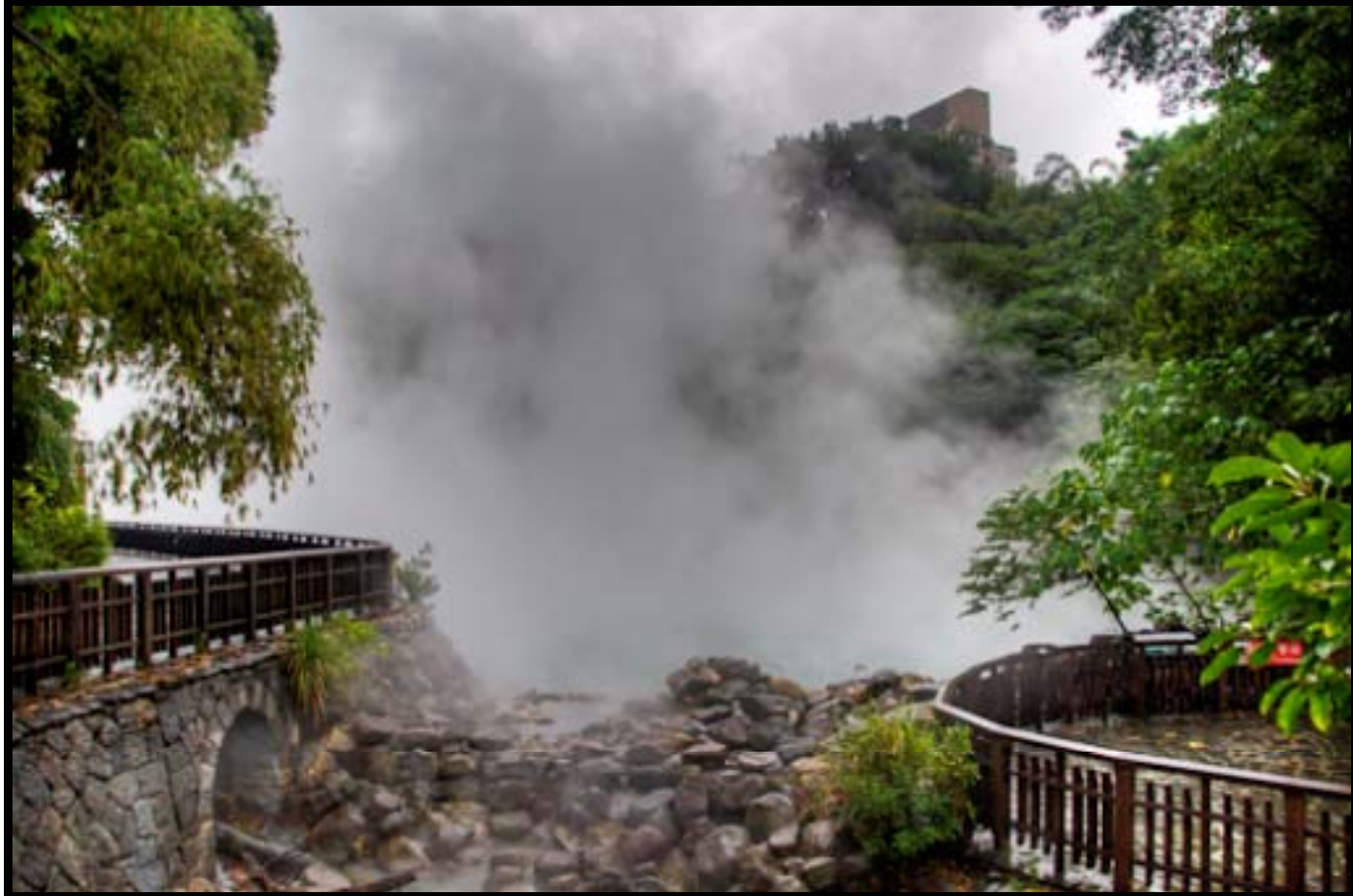
Beitou Hot Springs Park where water is ejected above 90°C.