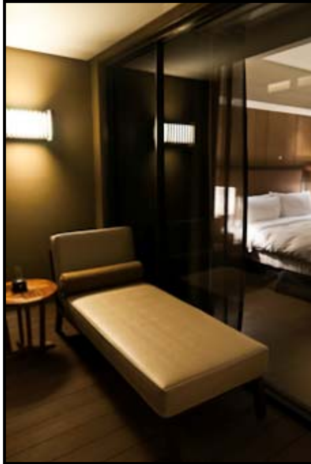
Lounge on outdoor porch at Grand View Resort Beitou in Taipei City, Taiwan,