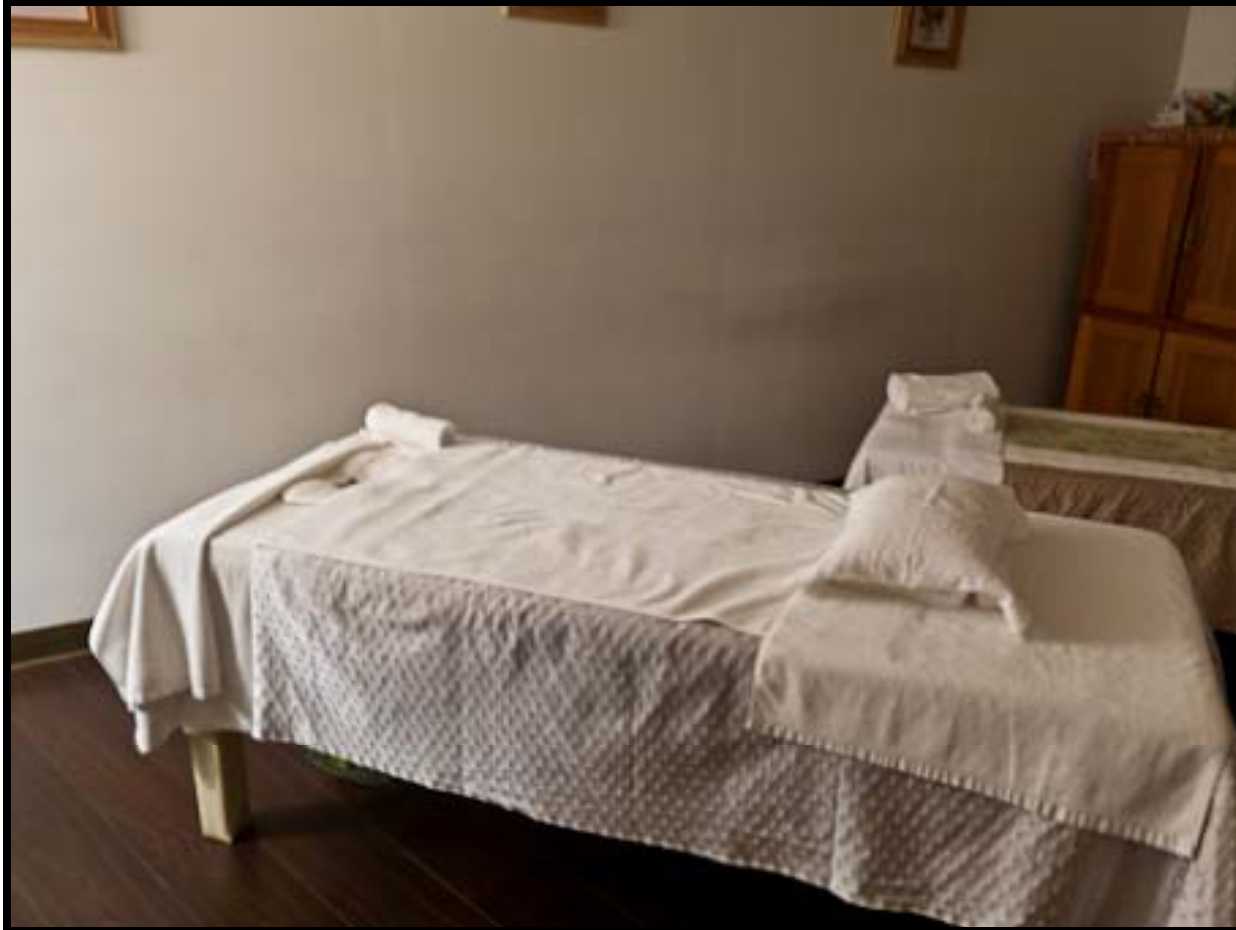
Massage table at Lulu Spa at Tien Lai Hot Spring Resort, Taipei County, Taiwan