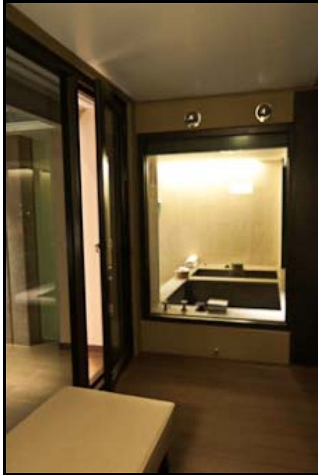
Grand View Resort Beitou in Taipei City, Taiwan,