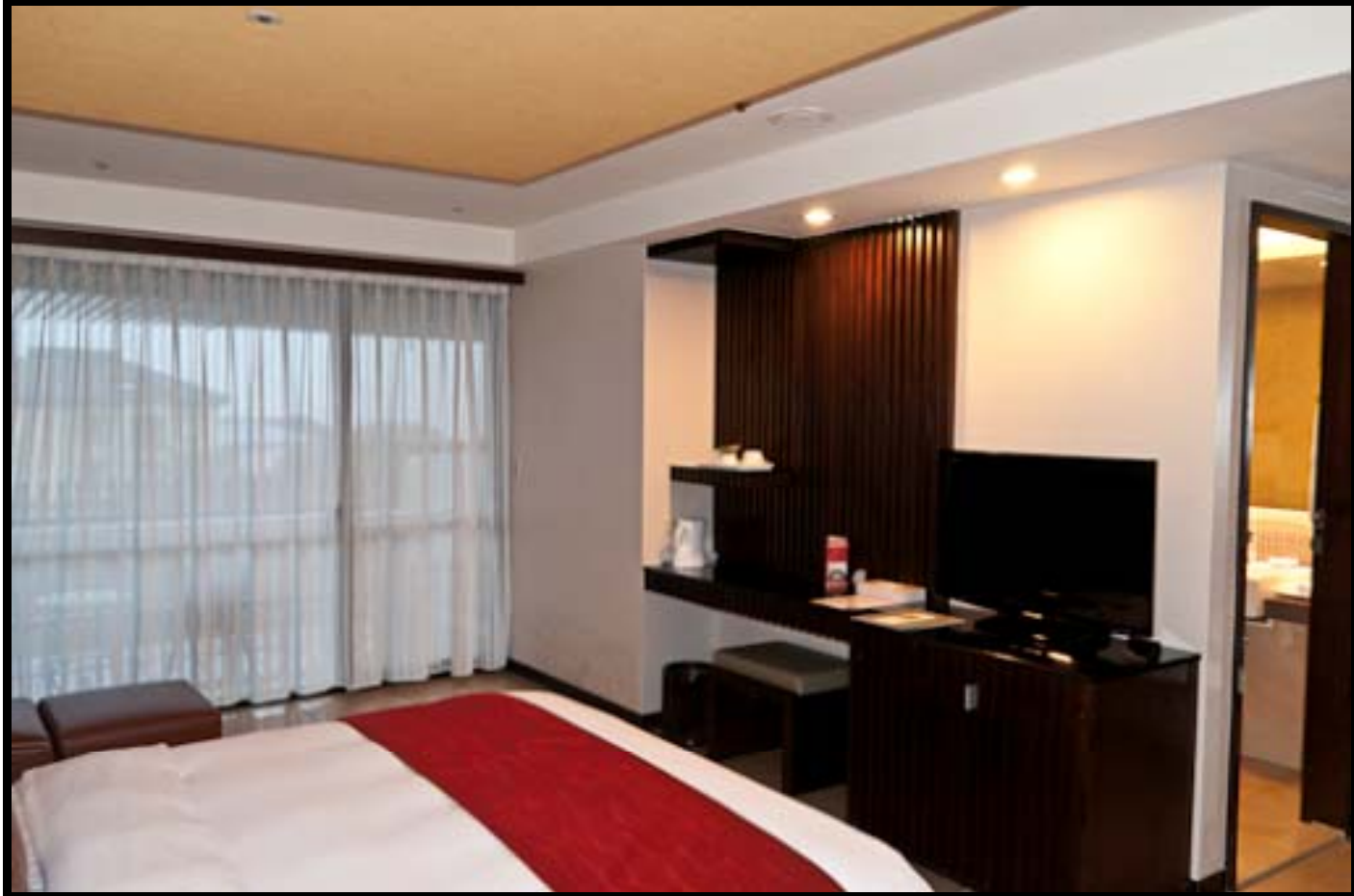
Bedroom at Tien Lai Hot Spring Resort, Taipei County, Taiwan