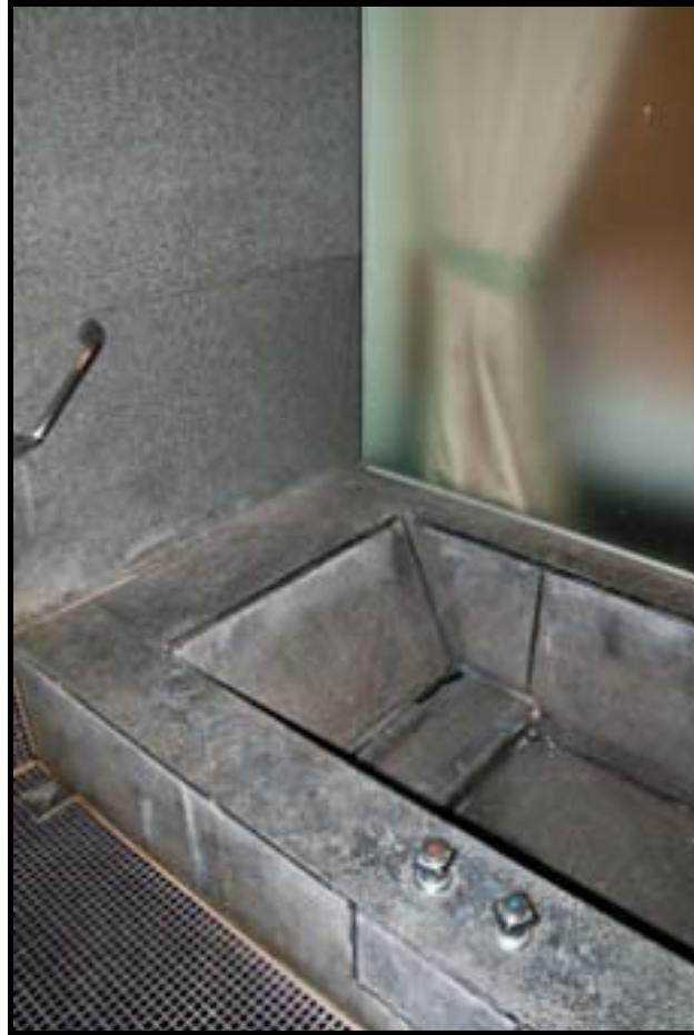
Hot springs tub at Luminous Hot Spring Resort & Spa in Luye, Taiwan