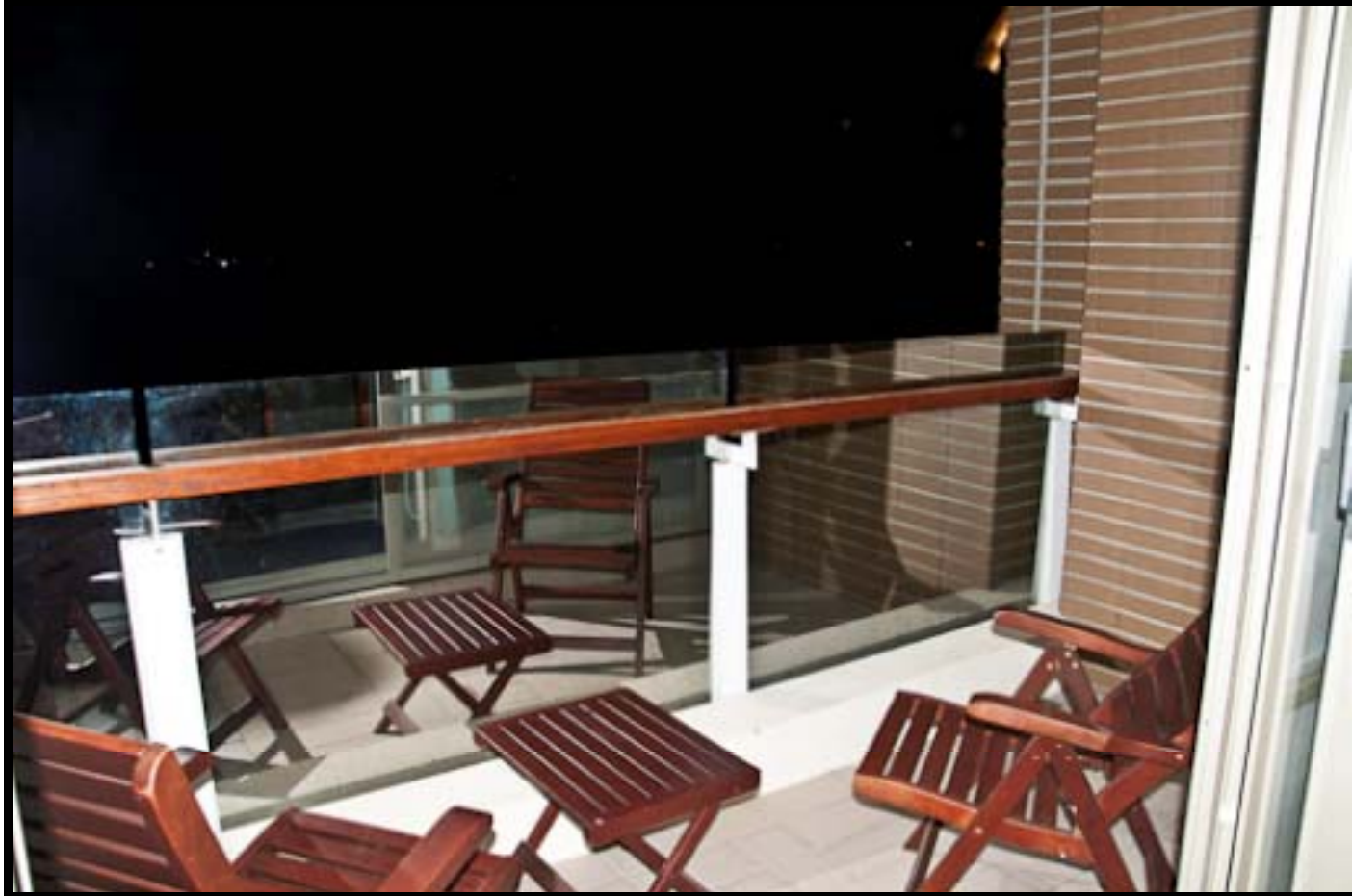
Outdoor porch at Luminous Hot Spring Resort & Spa in Luye, Taiwan