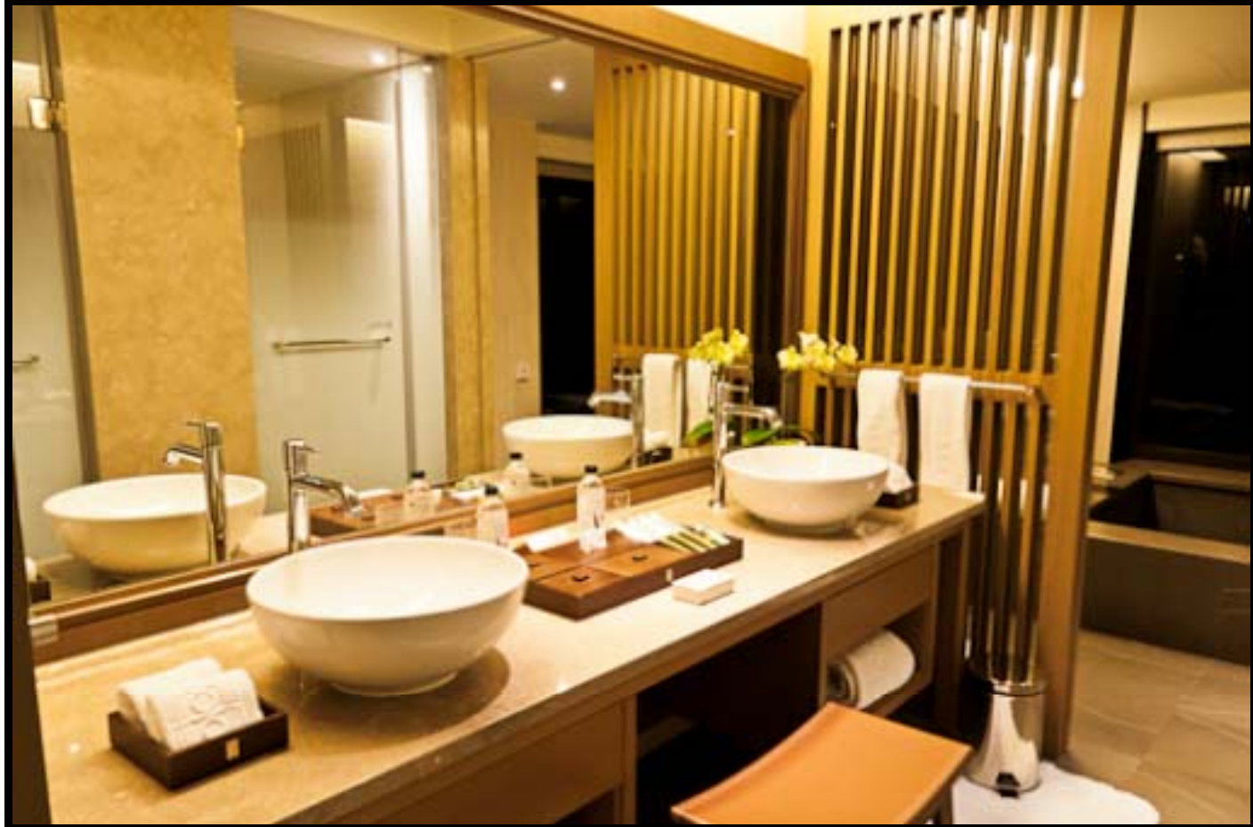
Bathroom at the Grand View Resort Beitou in Taipei City, Taiwan,