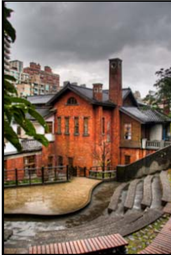
Beitou Public Hot Spring Bath - no longer in use as a public bath, but now converted into a museum about the history of the area's unique green sulphur volcanic geysers.