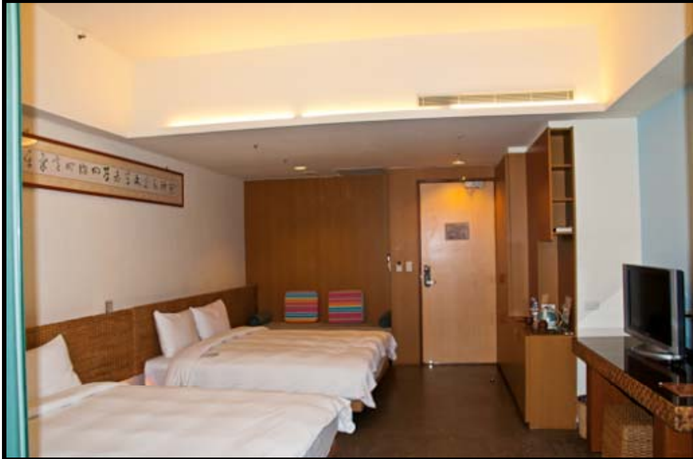
Bedroom at Luminous Hot Spring Resort & Spa in Luye, Taiwan