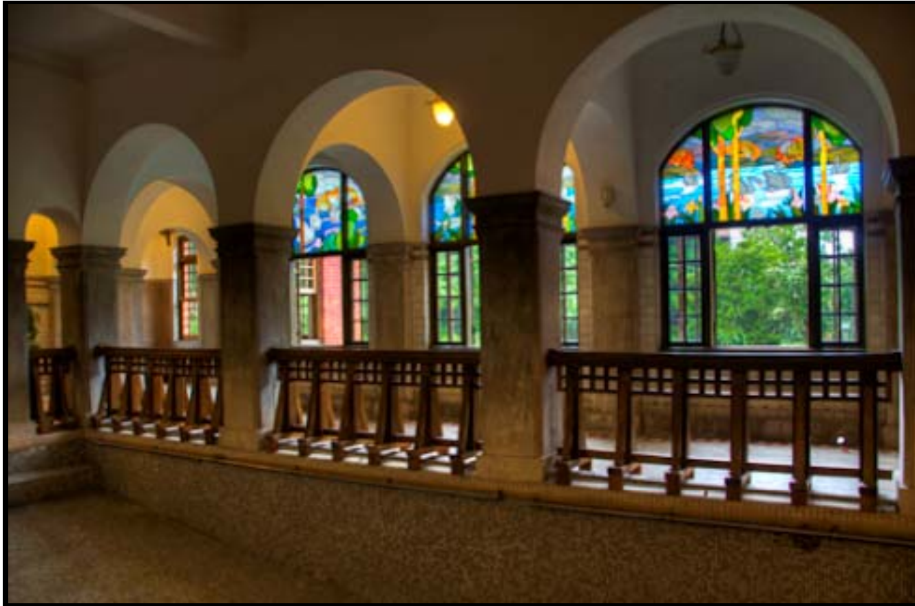
Beitou Public Hot Spring Bath - no longer in use as a public bath, but now converted into a museum about the history of the area's unique green sulphur volcanic geysers.