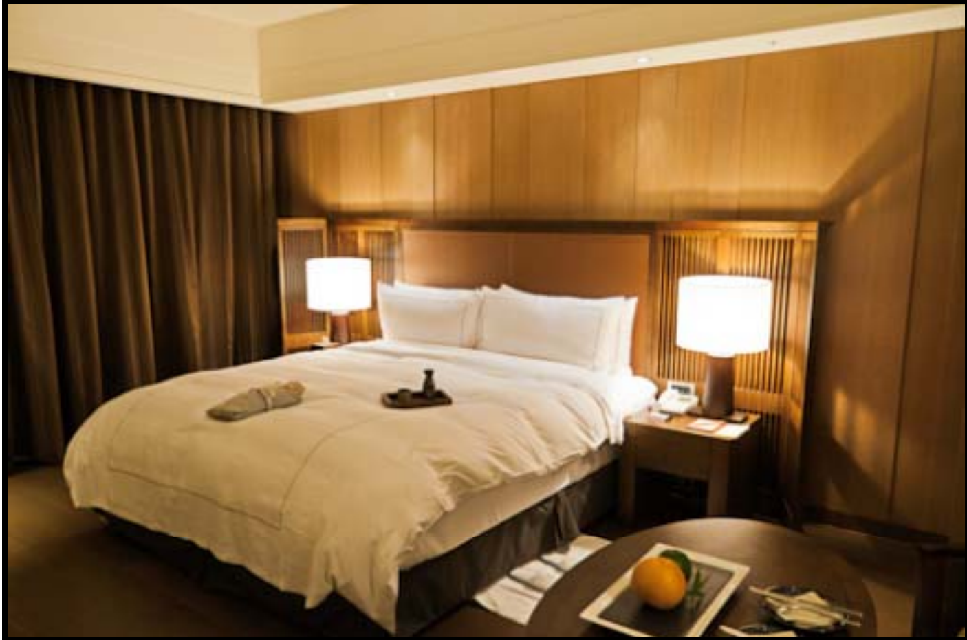
Bedroom at the Grand View Resort Beitou in Taipei City, Taiwan,