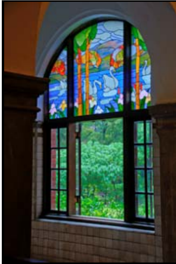
Beitou Public Hot Spring Bath - no longer in use as a public bath, but now converted into a museum about the history of the area's unique green sulphur volcanic geysers.