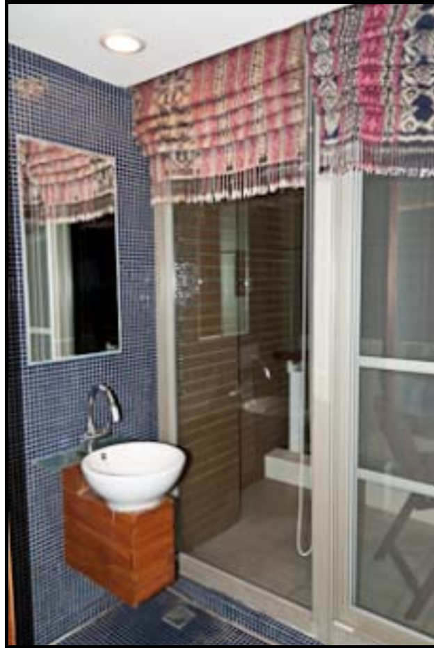
Bathroom at Luminous Hot Spring Resort & Spa in Luye, Taiwan