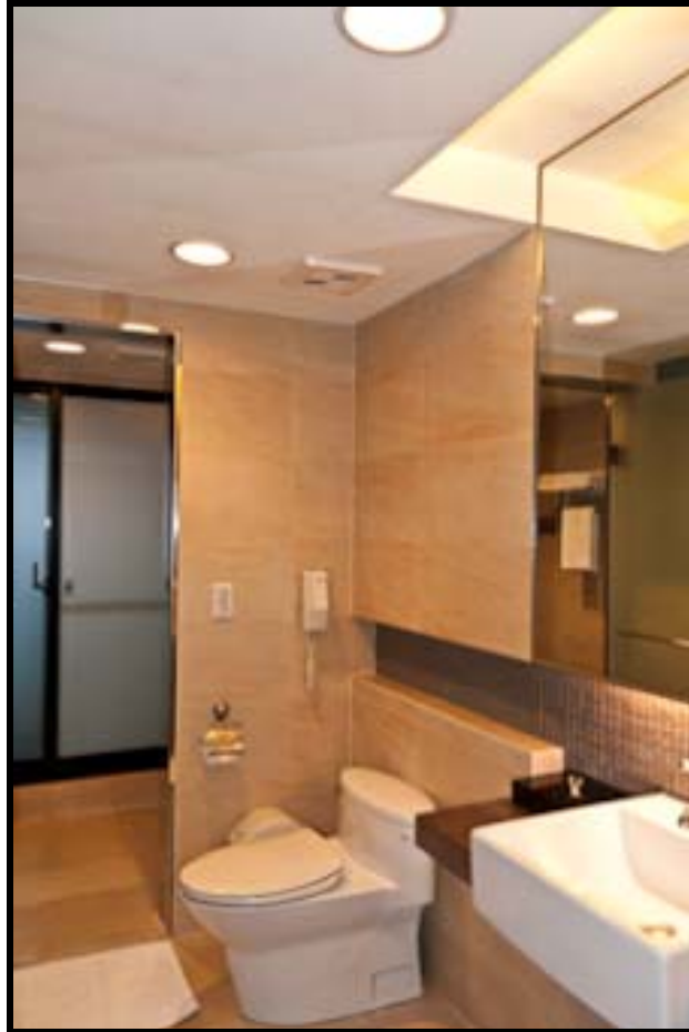
Bathroom at Tien Lai Hot Spring Resort, Taipei County, Taiwan